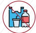
Plastic (including plastic bags, plastic wrap, silverware, straws, bottles)